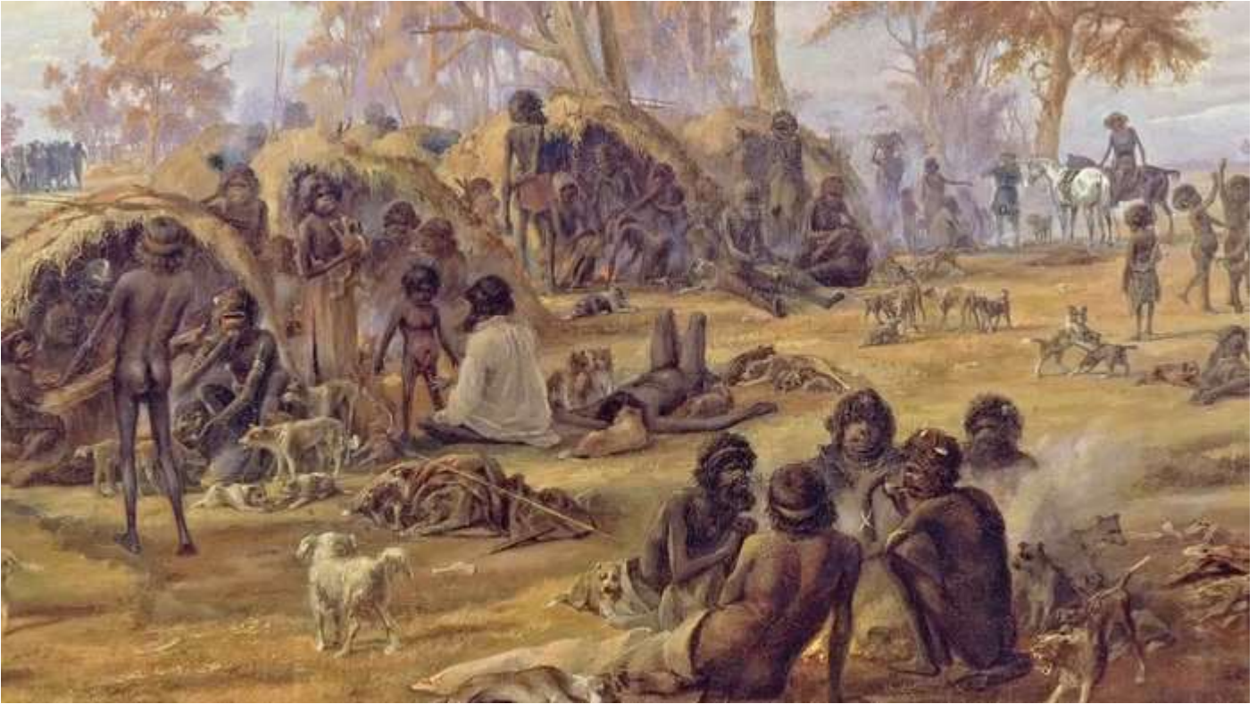
Figure 3: Alexander Schramm: Adelaide, a tribe of natives on the banks of the river Torrens, 1850 , National Gallery of Australia.