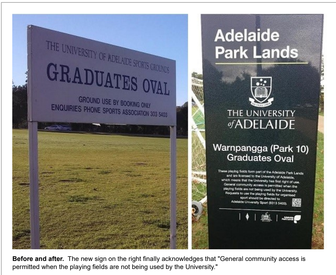
Before and after. The new sign on the right finally acknowledges that "General community access is permitted when the playing fields are not being used by the University."

In early May 2015, the old University Park Lands signs (left) were replaced with much more appropriate ones (right). The new ones make it much clearer that the public is not to be thrown out of the park, for playing there when the University is not using the facilities.