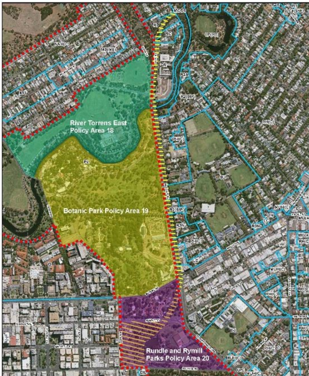
This is just some of the Park Lands potentially targeted for future "public infrastructure".

The proposal is to allow "public infrastructure" in these areas. What is public infrastructure? As well as the O-Bahn (and trucks, cars and proposed trams) through Rymill Park it includes items such as railways and railway buildings, pedestrian overpasses, tunnels, electricity sub-stations, sewerage treatment works, bus depots, and possibly public schools. It's a very wide ambit.