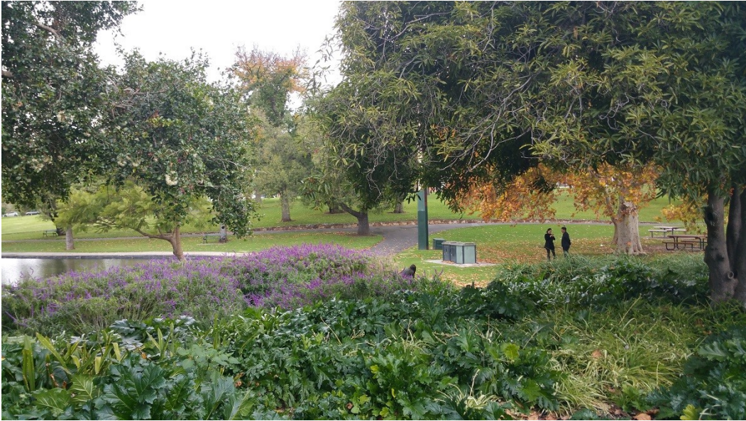
Rymill Park is still very much at risk