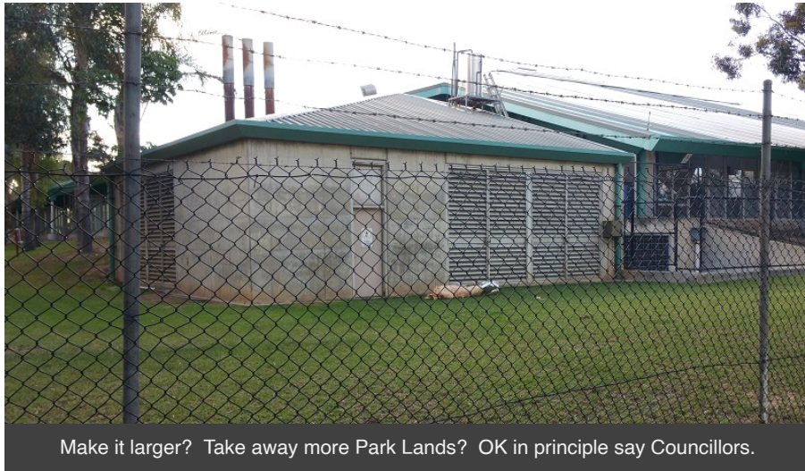
Make it larger? Take away more Park Lands? OK in principle say Councillors.

The Council's decision is probably just pie-in-the-sky, but it is disturbing that not a single Councillor resisted this tenuous thought-bubble about yet another potential even larger encroachment into the Park Lands.