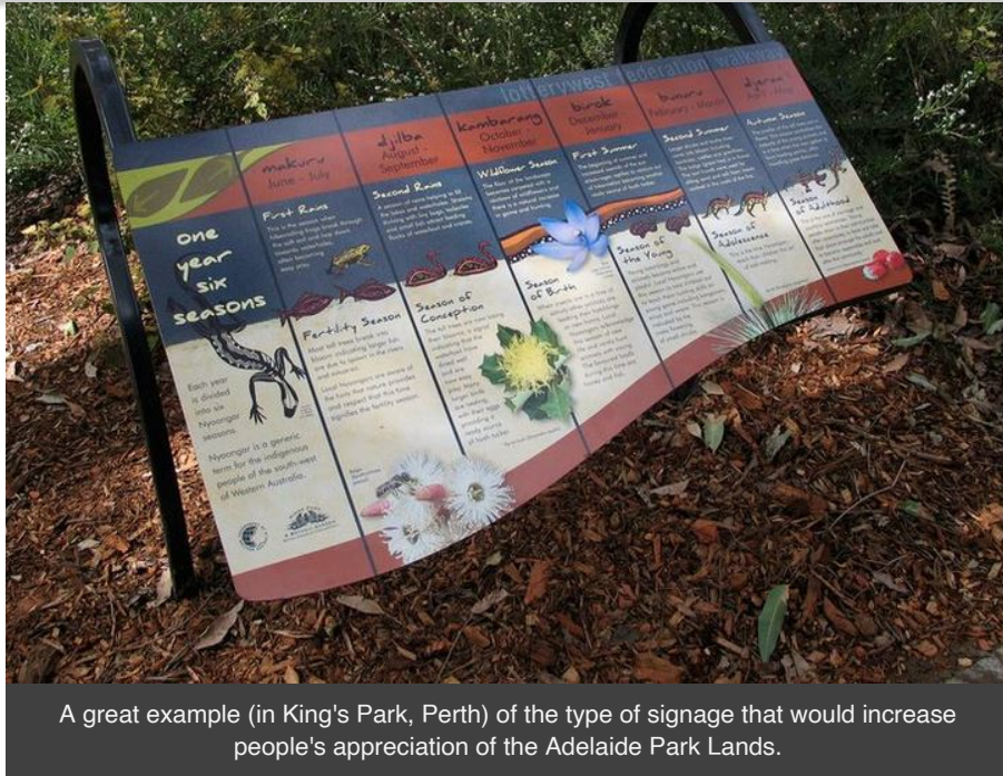
A great example (in King's Park, Perth) of the type of signage that would increase people's appreciation of the Adelaide Park Lands.