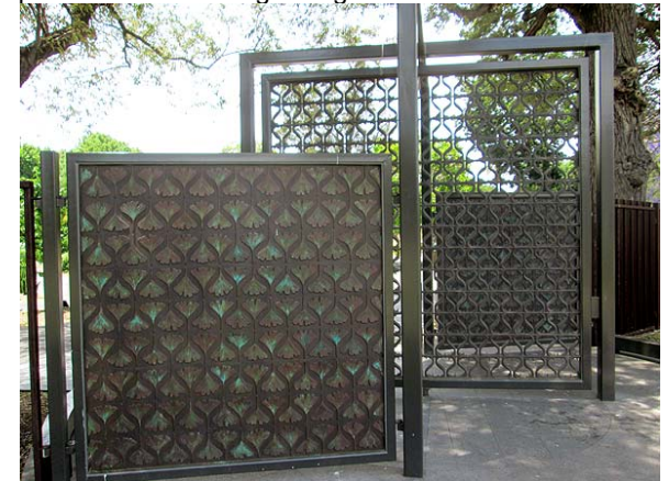
2010 Ginkgo gate

The fan or butterfly-shaped motif adorning the Gate is the leaf of the Ginkgo Biloba tree. There’s a living specimen of this tree growing here near the Gates.