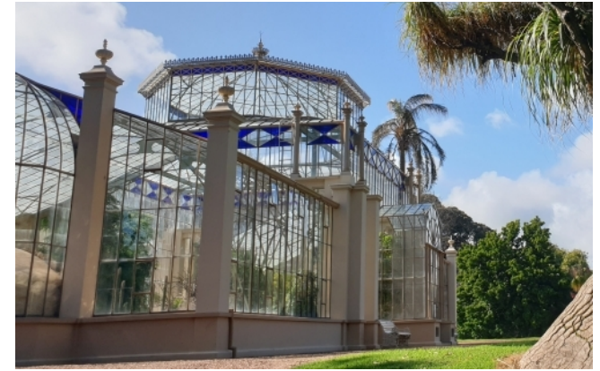
1877 Palm House

Imported from Germany, 1877 – and painstakingly restored in the 1990’s, it is thought to be the only surviving such building in the world. It hosts plants from Madagascar.