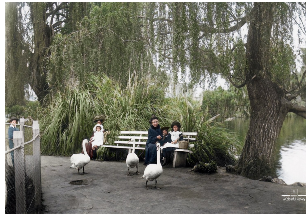
Pictured 1908 and colourised by Kelly Bonato

Despite its engineered appearance this was a Kurna waterhole long pre-dating European settlement.