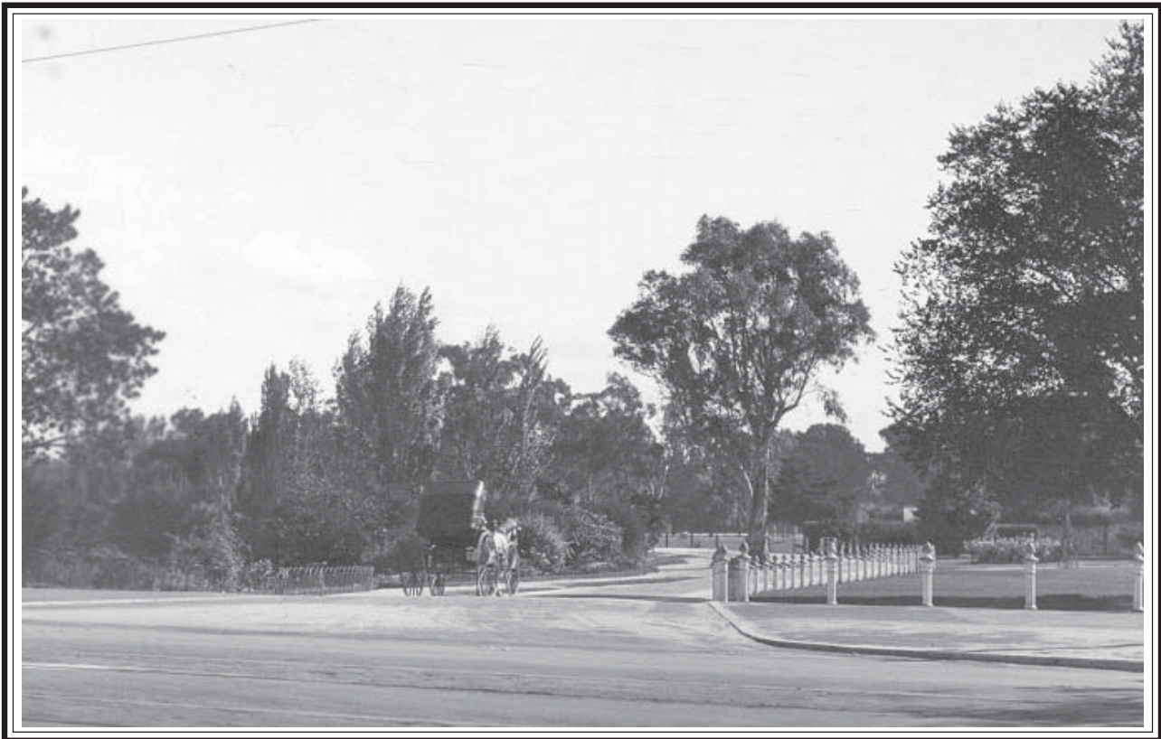
The River Red Gum near the centre of these photos was photographed in 1925 (above, supplied courtesy of the Adelaide City Council archives) and 2003 (below, photo taken by Kyle Penick). The location is War Memorial Drive, just west of King William Street.