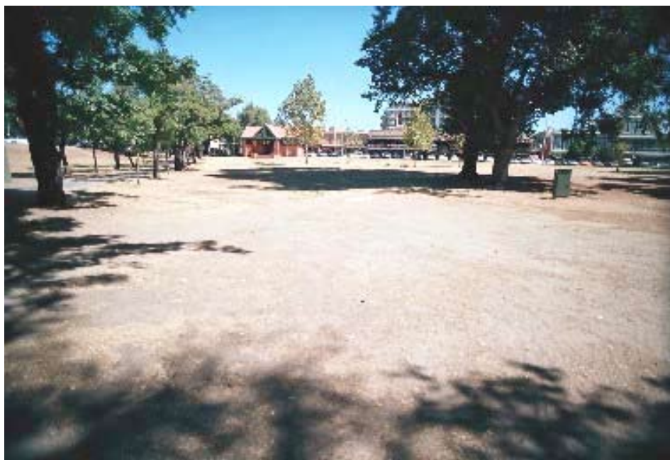
Above: Rundle Park in the eastern Park Lands looking towards the public toilets and East Terrace. This is part of the Garden of Unearthly Delights site occupied for six weeks, including set-up and pull-down. Photo taken by the author in April 2008 after most of the infrastructure was removed.

The apparent incompetence of the ACC is masked in soothing words that 'the event is popular'. Of course, the event is popular for reasons other than artistic display and merit. The ACC argument is nonsense. One would have no doubt that mud wrestling would be equally as popular if accompanied with the appropriate alcoholic lubricants. Apparently no-one in the ACC with the power to make decisions can be bothered to actually look at the reason for local residents' anger and complaints at the