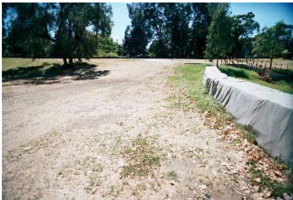
Above: New road created by transports accessing the GUD site from Botanic Road. This is normally grassed. Photo taken by author in April 2008.

If minded to let the area to the GUD as a cover for an alcoholic fast food sideshow alley rather than artistic festival performances, the ACC should embark on true cost recovery and protection of the area concerned. The public accepts a wide range of temporary use and alienation of Park Land areas for legitimate reasons. However, when members of the public complain, they do not deserve to be told that the price