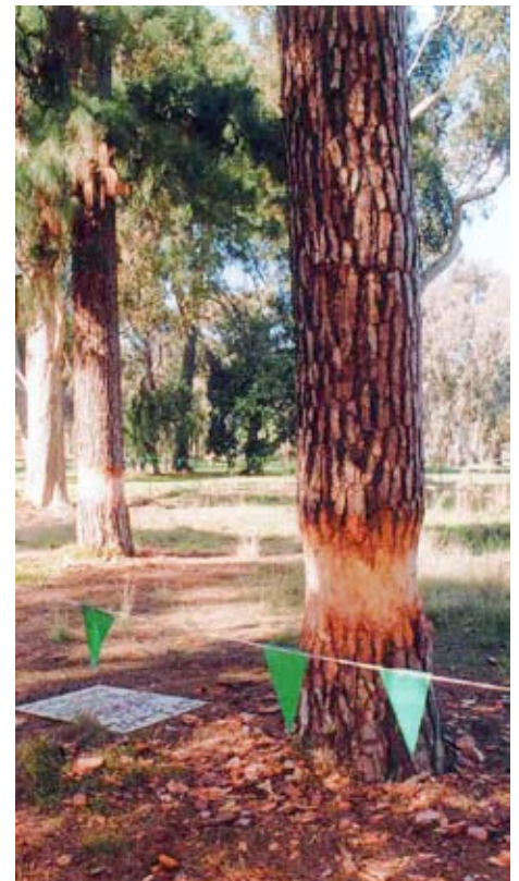
Above: The Canary Island pine on the right still survives. The one on the left was chopped down in May 2008.

Photo taken by Gunta Groves, 5 June 2004.