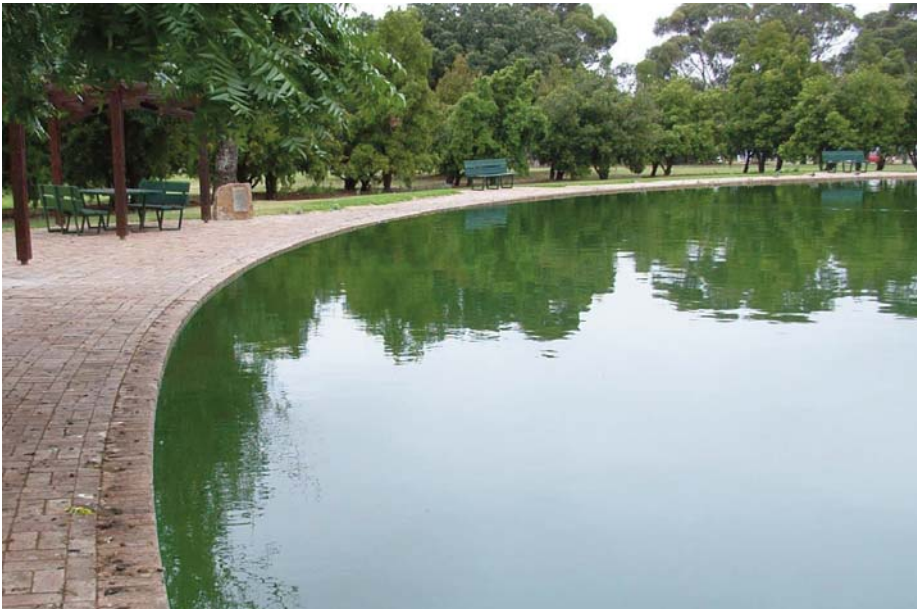
Above: The Bonython Park pond for model boats is open for business once again.