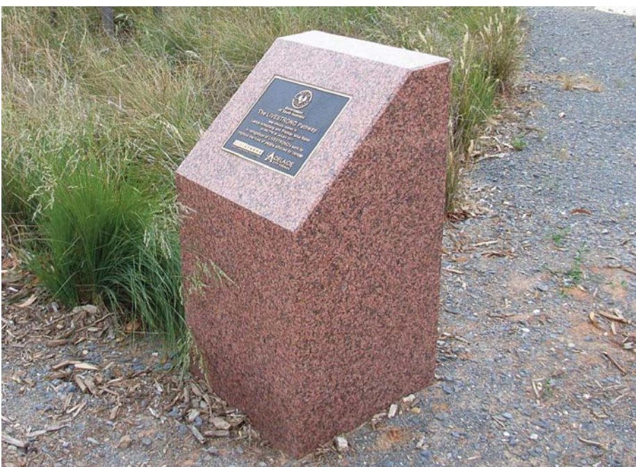
The Livestrong Pathway 'directional sign' which doesn't really give any indication of direction, either from the pathway or from the road. It looks like a substantial monument/plaque. Photo taken by Gunta Groves, 6 November 2011.

Unlike buses, if a tram breaks down, the others find it difficult to go around it. Face it, trams are Rann's way of creating himself a legacy and an apt one at that: They're very visible but next to useless.