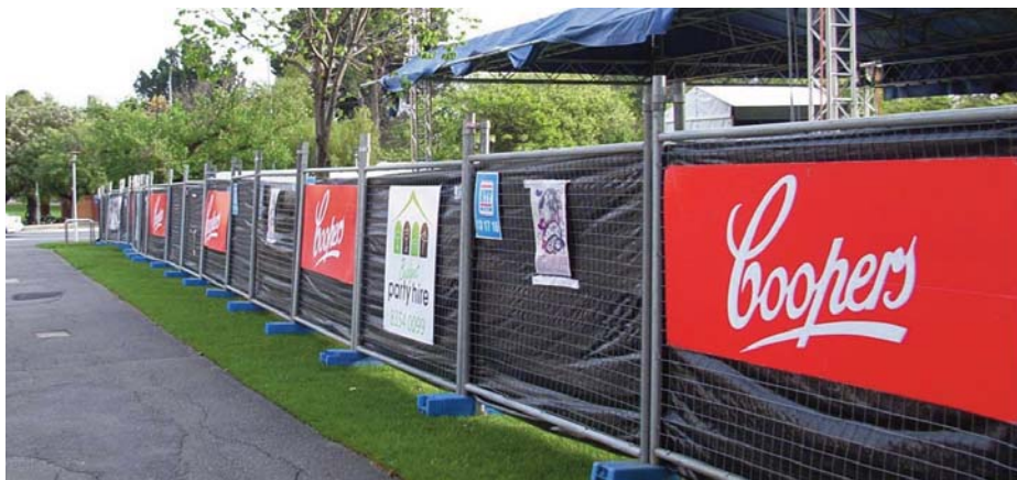
Above: Corporate citizenship or corporate contempt? Fences that keep out the public (except those who can pay) from the Park Lands display prominent advertising. 30 October 2011.

The photograph below was taken on the occasion of the Woodstock Revisited 2011 event in Rymill Park on 30 October 2011. At least seven Coopers advertising banners, measuring approximately 2 metres by 1 metre, were attached to the temporary event fencing fronting East Terrace, blotting the landscape and in direct contravention of the Adelaide City Council's Park Lands advertising policy. Decide for yourself the standard of corporate citizenship on display from Coopers Brewery Limited.