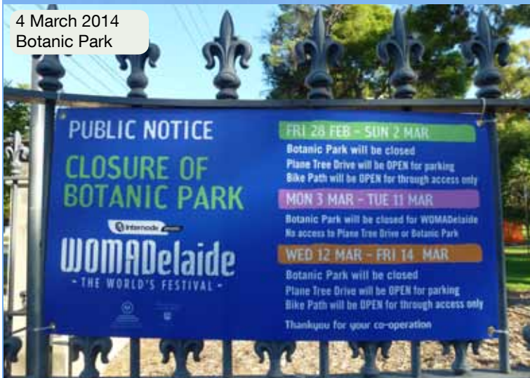
4 March 2014 Botanic Park