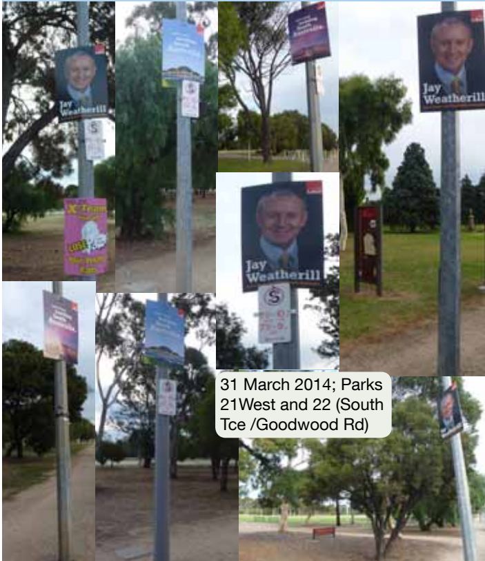
31 March 2014; Parks 21West and 22 (South Toe /Goodwood Rd)