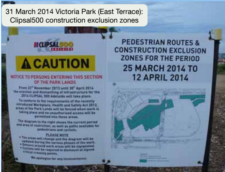
31 March 2014 Victoria Park (East Terrace): Clipsal500 construction exclusion zones