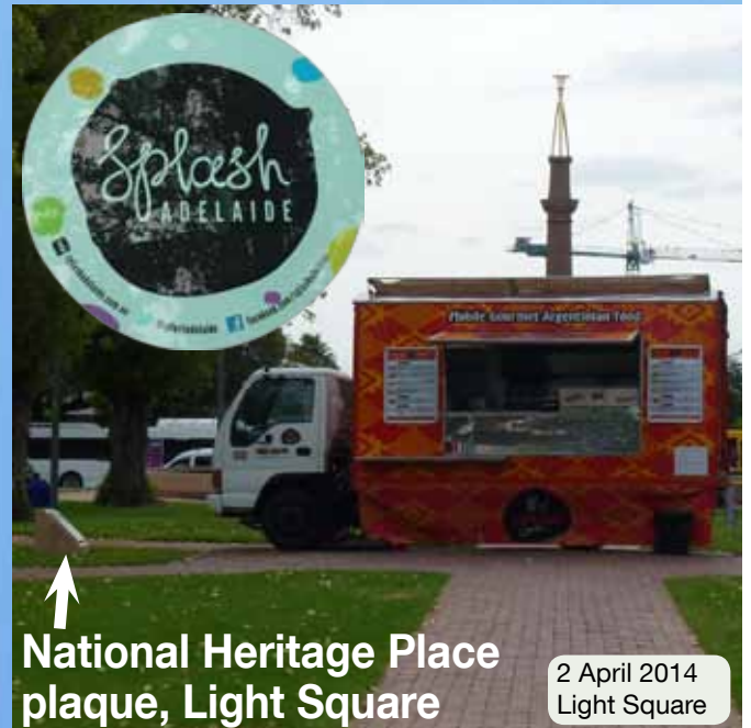
National Heritage Place plaque, Light Square