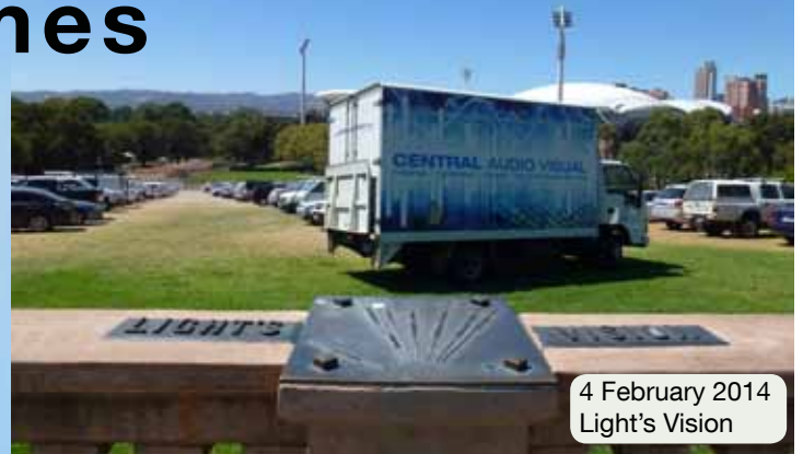
4 February 2014 Light's Vision