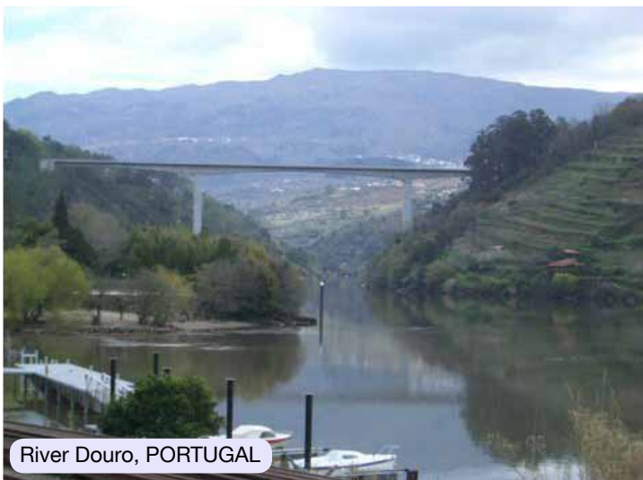
River Douro, PORTUGAL