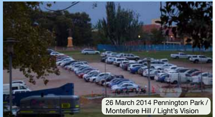
26 March 2014 Pennington Park / Montefiore Hill / Light's Vision