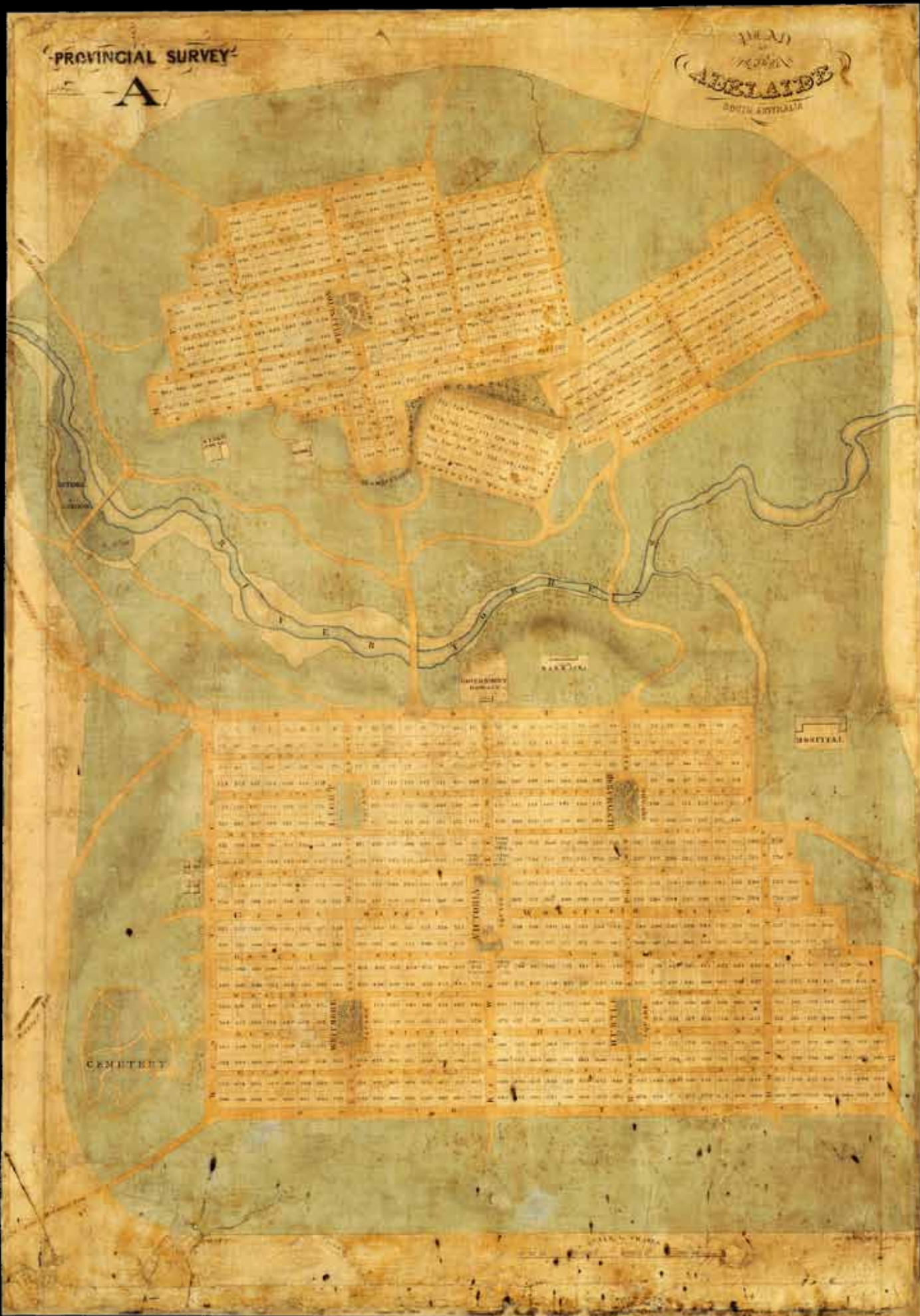
William Light's 1837 Plan of Adelaide, South Australia—Provincial Survey A