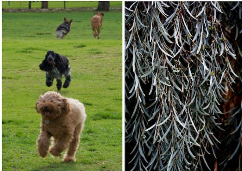
Dog Park, and weeping myall tree in Bragg Park / Ngampa Yarta (Park 5)

On Sunday 16 May, a group of twenty walkers traced a comprehensive loop into the gorgeous native bush land of Yam Daisy Park / Kantarilla ( Park 3 ), through the dog-lovers' paradise of Bragg Park / Ngampa Yarta ( Park 5 ) and back to the hillock hiding one of Adelaide's architectural treasures in Reservoir Park / Kangatilla ( Park 4 ).