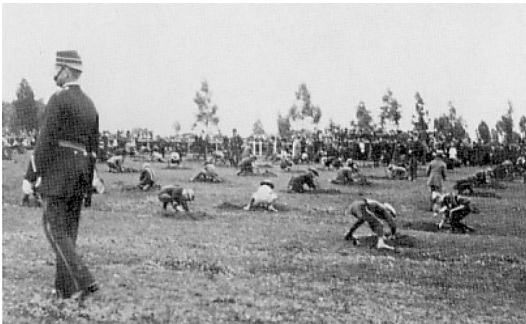
Arbor day, June 1889. Schoolchildren planting trees in this Park.

Many of the trees in this part of the Park still survive after being planted by schoolchildren in 1889.