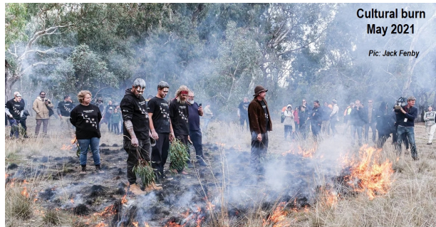
Cultural burn May 2021

The trail is used by thousands of regular cyclists, walkers and runners. The fenced tennis courts are leased by Christian Brothers College but are available for community use during daylight hours when not used by the school.