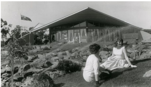
Est. 1963 as the "Alpine Restaurant"