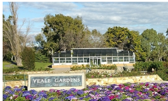
Erected in the 1960s. Demolished in 2016.