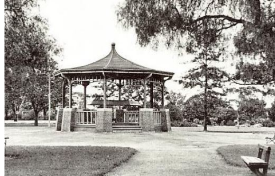
As it looked in 1928

The rotunda was opened in 1909, complete with electric lights. Used for concerts until the 1940’s.