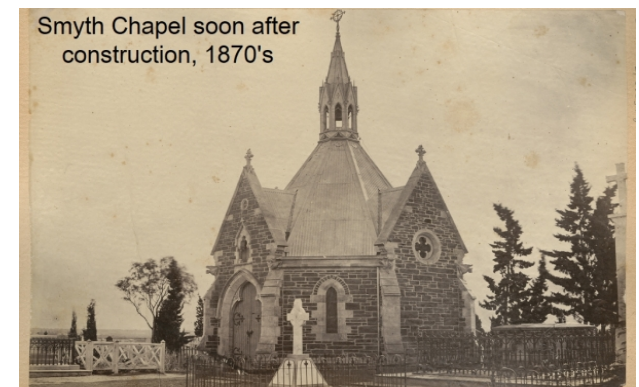
Smyth Chapel soon after construction, 1870’s

Octagonal, Gothic - on the State Heritage register.