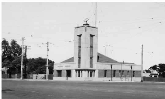
1940-1979 Adelaide "Weather Bureau" in Park 24

A "Weather Bureau" building was on this corner from 1940. When the Bureau moved to Kent Town in 1977, the Education Dept unsuccessfully sought to expand the High School onto this now-revegetated corner of Park 24.