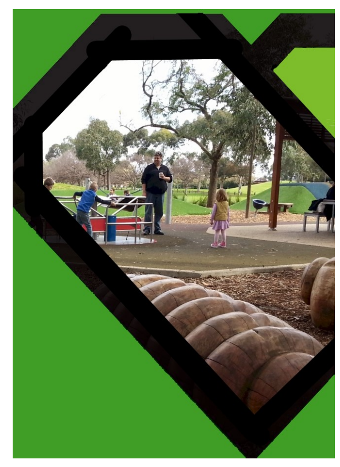
This trail guide traerses traditional lands of the Kaurna people. We acknowledge and pay respect to the past, present and future traditional custodians and elders of this land.

Scan the QR code on the back of this leaflet for the full Trail Guide