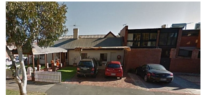
The former Sheridan Theatre (left) & 1960s town houses