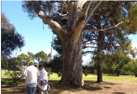
Century-old sugar gum

A Himalayan Cypress, and a sugar gum more than 100 years old. A metal maintenance shed on the corner was due for demolition in 2023.