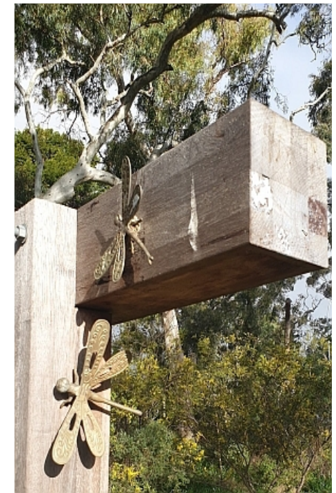
Dragonflies on a timber frame on the bushland trail

Historic houses fronting Park 9 include #50 which has been a school ("Keith House" from 1850s) the "Keith Sheridan Institute (from 1925) and "Sheridan Theatre" (from 1963). It's now a private house.