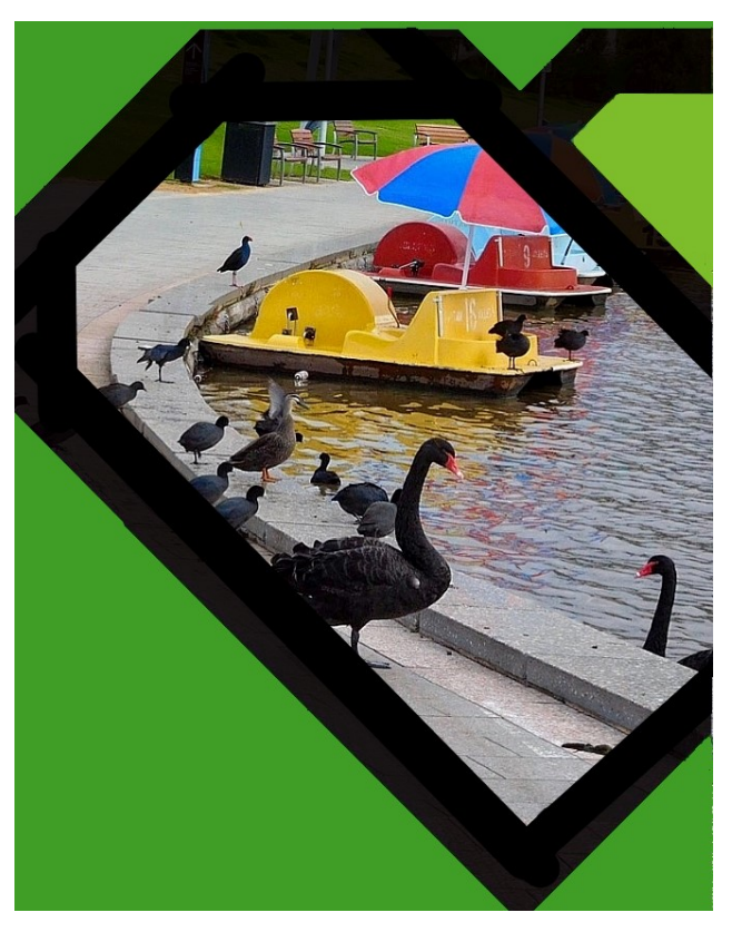
This Trail Guide traverses traditional lands of the Kaurna people. We acknowledge and pay respect to the past, present and future traditional custodians and elders of this land.

Scan the QR code on the back of this leaflet for the full Trail Guide